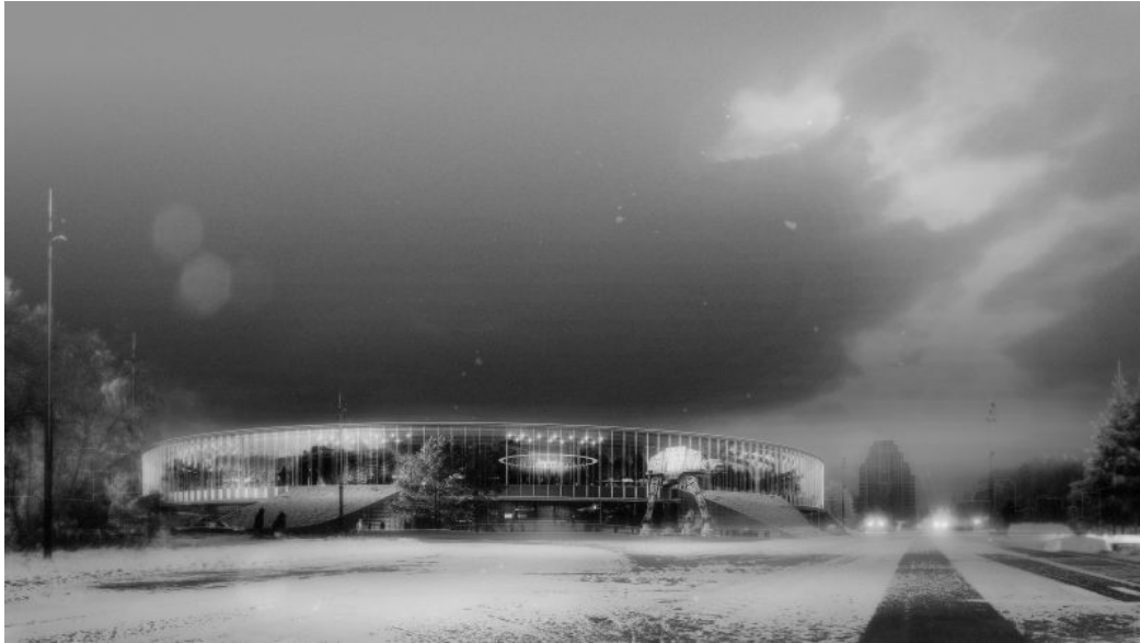
Figure 3. Title [Type of Media] It represents a considerable part of the building economy.