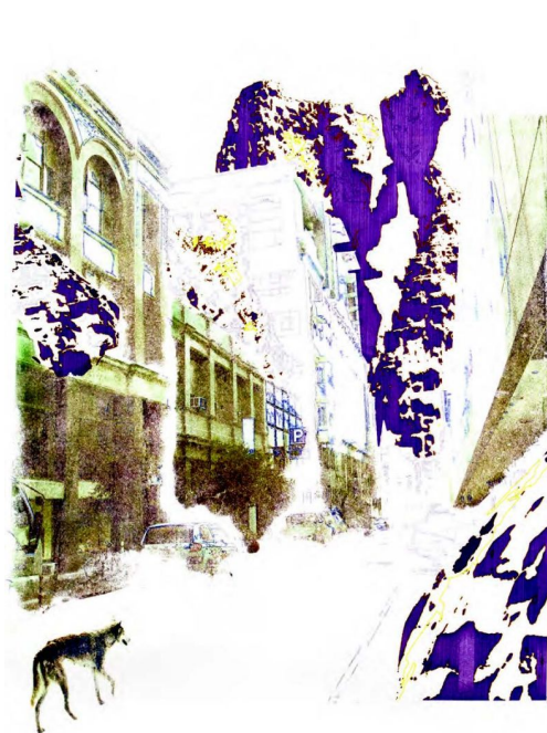
Figure 3. Titel Test It represents a considerable part of the building economy.