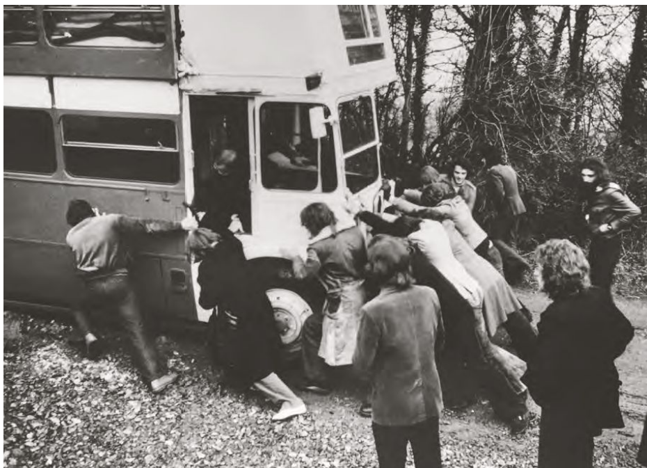
Figure 2. Title [Type of Media] It represents a considerable part of the building economy.

CANDIDE NO. XX - TITLE OF THE ISSUE CANDIDE JOURNAL FOR ARCHITECTURAL KNOWLEDGE